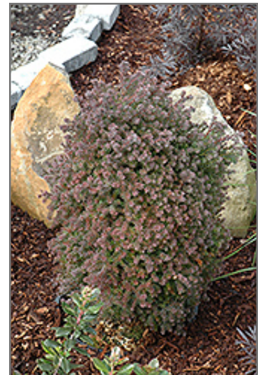
Red Star Whitecedar