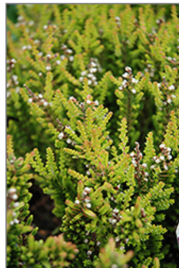
Firefly Heather foliage

940 Montauk Highway Bayport, New York web: bayportflower.com phone: 1-800-729-0822