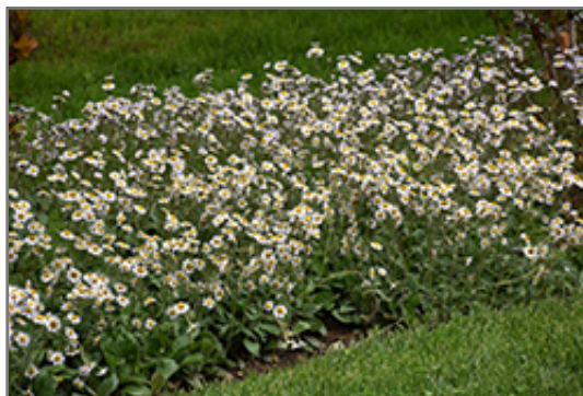
Lynnhaven Carpet Fleabane in bloom

940 Montauk Highway Bayport, New York web: bayportflower.com phone: 1-800-729-0822