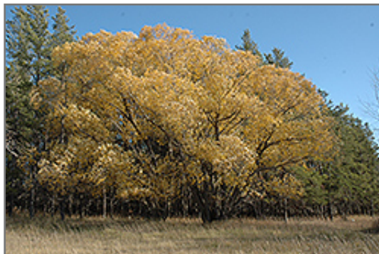
White Willow in fall