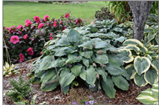
Shadowland Diamond Lake Hosta

Shadowland Diamond Lake Hosta is recommended for the following landscape applications;