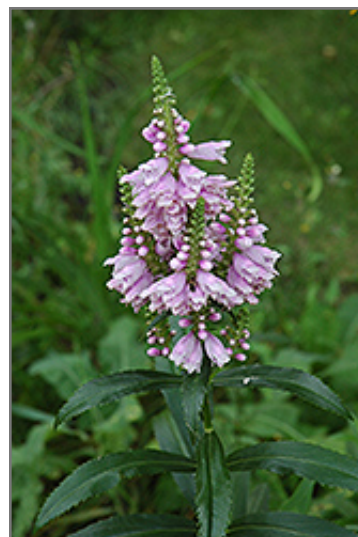
Obedient Plant flowers