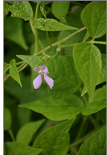
Golden Wax Bean flowers

Golden Wax Bean will grow to be about 10 feet tall at maturity, with a spread of 24 inches. When planted in rows, individual plants should be spaced approximately 12 inches apart. Because of its vigorous growth habit, it may require staking or supplemental support. This fast-growing vegetable plant is an annual, which means that it will grow for one season in your garden and then die after producing a crop. Because of its relatively short time to maturity, it lends itself to a series of successive plantings each staggered by a week or two; this will prolong the effective harvest period.