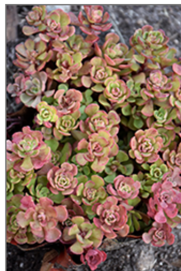
Pink Form Southern Stonecrop

940 Montauk Highway Bayport, New York web: bayportflower.com phone: 1-800-729-0822