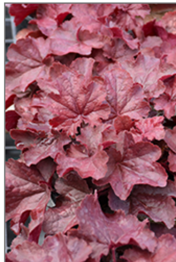
Northern Exposure Red Coral Bells foliage

Northern Exposure Red Coral Bells is recommended for the following landscape applications;