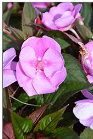
SunPatiens Vigorous Lavender Splash New Guinea Impatiens flowers