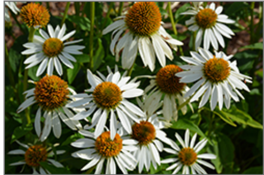
Happy Star Coneflower flowers

Happy Star Coneflower is recommended for the following landscape applications;