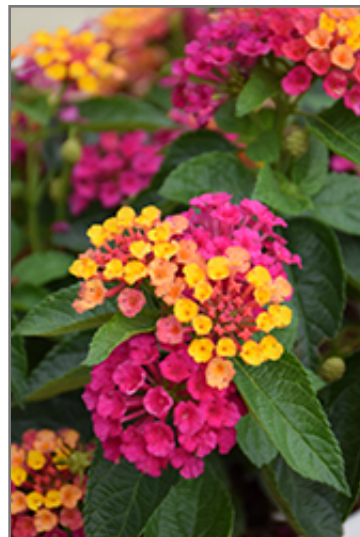
Luscious Royale Cosmo Lantana flowers

Luscious Royale Cosmo Lantana is recommended for the following landscape applications;