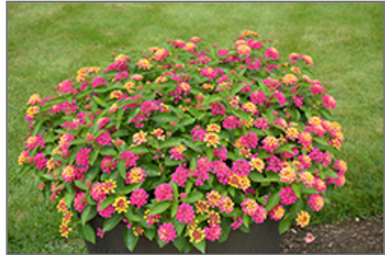
Luscious Royale Cosmo Lantana in bloom

Luscious Royale Cosmo Lantana will grow to be about 18 inches tall at maturity, with a spread of 24 inches. When grown in masses or used as a bedding plant, individual plants should be spaced approximately 18 inches apart. Although it's not a true annual, this fast-growing plant can be expected to behave as an annual in our climate if left outdoors over the winter, usually needing replacement the following year. As such, gardeners should take into consideration that it will perform differently than it would in its native habitat.