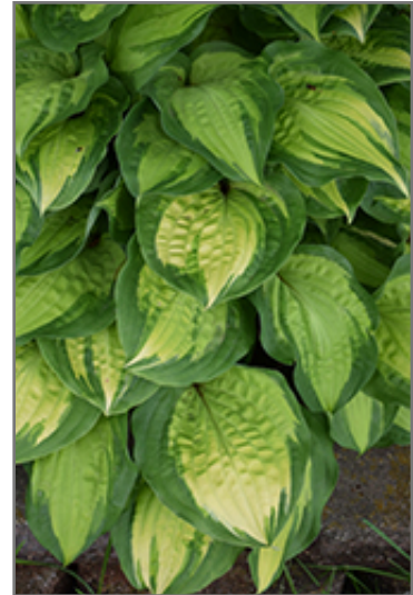
Island Breeze Hosta foliage