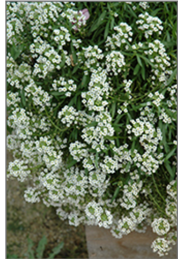
Stream Silver Sweet Alyssum flowers

Stream Silver Sweet Alyssum is recommended for the following landscape applications;