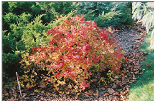
Golden Princess Spirea in fall