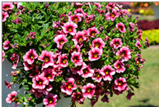
Hula Hot Pink Calibrachoa flowers

Hula Hot Pink Calibrachoa is recommended for the following landscape applications;