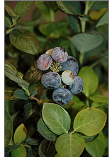
Peach Sorbet Blueberry fruit

Peach Sorbet Blueberry features dainty clusters of white bell-shaped flowers hanging below the branches in mid spring. It has green evergreen foliage. The glossy oval leaves turn an outstanding deep purple in the fall, which persists throughout the winter. It features an abundance of magnificent blue berries from early to mid summer.