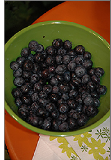
Peach Sorbet Blueberry fruit

This shrub is quite ornamental as well as edible, and is as much at home in a landscape or flower garden as it is in a designated edibles garden. It does best in full sun to partial shade. It does best in average to evenly moist conditions, but will not tolerate standing water. It is very fussy about its soil conditions and must have sandy, acidic soils to ensure success, and is subject to chlorosis (yellowing) of the foliage in alkaline soils. It is quite intolerant of urban pollution, therefore inner city or urban streetside plantings are best avoided, and will benefit from being planted in a relatively sheltered location. Consider applying a thick mulch around the root zone in winter to protect it in exposed locations or colder microclimates. This particular variety is an interspecific hybrid.