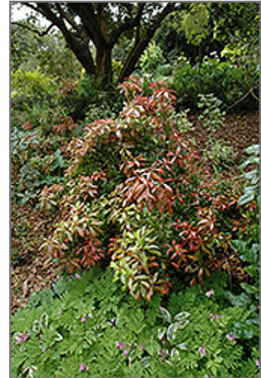
Mountain Fire Japanese Pieris

This shrub does best in full sun to partial shade. It requires an evenly moist well-drained soil for optimal growth, but will die in standing water. It is very fussy about its soil conditions and must have rich, acidic soils to ensure success, and is subject to chlorosis (yellowing) of the foliage in alkaline soils. It is somewhat tolerant of urban pollution, and will benefit from being planted in a relatively sheltered location. Consider applying a thick mulch around the root zone in winter to protect it in exposed locations or colder microclimates. This is a selected variety of a species not originally from North America, and parts of it are known to be toxic to humans and animals, so care should be exercised in planting it around children and pets.