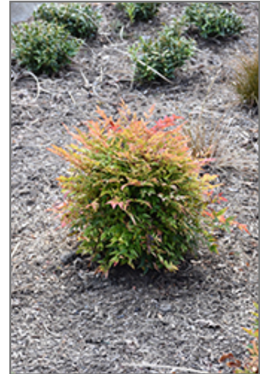
Gulf Stream Dwarf Nandina