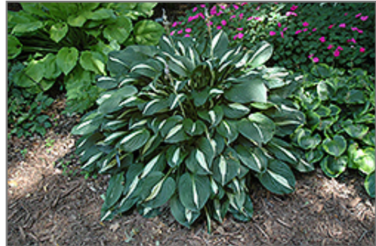
Risky Business Hosta