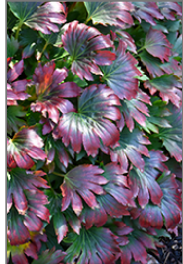
Crimson Fans Mukdenia foliage

Crimson Fans Mukdenia is recommended for the following landscape applications;