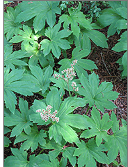
Crimson Fans Mukdenia flowers

Crimson Fans Mukdenia is a fine choice for the garden, but it is also a good selection for planting in outdoor pots and containers. It is often used as a 'filler' in the 'spiller-thriller-filler' container combination, providing a mass of flowers and foliage against which the larger thriller plants stand out. Note that when growing plants in outdoor containers and baskets, they may require more frequent waterings than they would in the yard or garden.