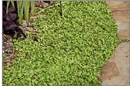
Creeping Mazus

Creeping Mazus will grow to be only 2 inches tall at maturity extending to 3 inches tall with the flowers, with a spread of 12 inches. Its foliage tends to remain low and dense right to the ground. It grows at a fast rate, and under ideal conditions can be expected to live for approximately 10 years. As an evergreen perennial, this plant will typically keep its form and foliage year-round.