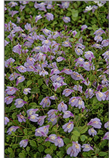
Creeping Mazus flowers

Creeping Mazus is recommended for the following landscape applications;