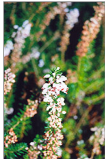
Scotch Heather flowers