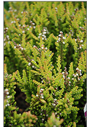
Firefly Heather foliage