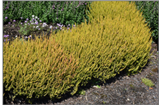
Firefly Heather

This shrub should only be grown in full sunlight. It requires an evenly moist well-drained soil for optimal growth, but will die in standing water. It is very fussy about its soil conditions and must have sandy, acidic soils to ensure success, and is subject to chlorosis (yellowing) of the foliage in alkaline soils. It is somewhat tolerant of urban pollution, and will benefit from being planted in a relatively sheltered location. Consider applying a thick mulch around the root zone in winter to protect it in exposed locations or colder microclimates. This is a selected variety of a species not originally from North America.