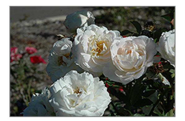
Snowdrift Rose flowers

940 Montauk Highway Bayport, New York web: bayportflower.com phone: 1-800-729-0822