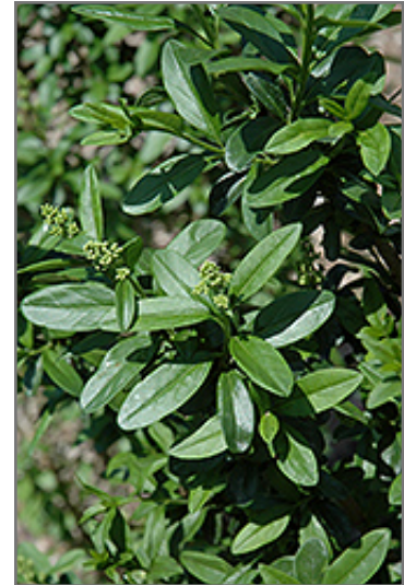
California Privet foliage

California Privet will grow to be about 10 feet tall at maturity, with a spread of 10 feet. It has a low canopy with a typical clearance of 1 foot from the ground, and is suitable for planting under power lines. It grows at a fast rate, and under ideal conditions can be expected to live for approximately 30 years.