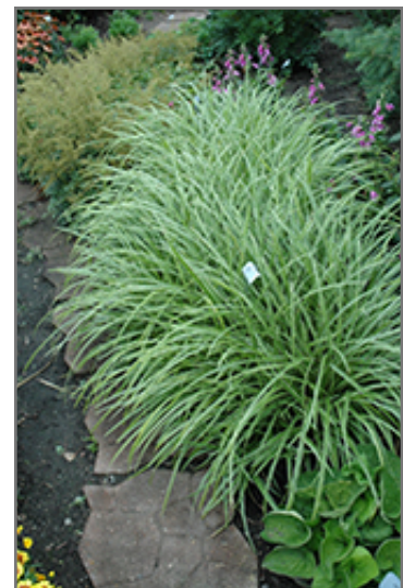
Ice Dance Sedge