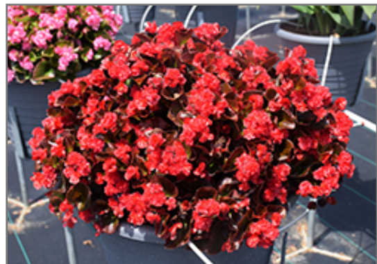
Double Up Red Begonia in bloom