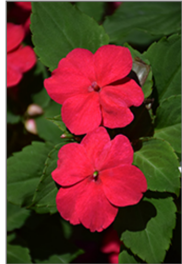
Imara XDR Rose Impatiens flowers

Imara XDR Rose Impatiens is recommended for the following landscape applications;