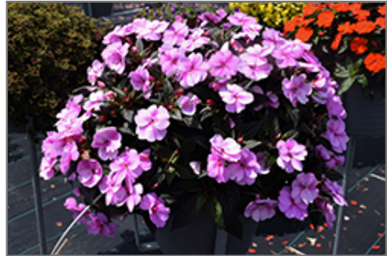
SunPatiens Vigorous Lavender Splash New Guinea Impatiens in bloom

SunPatiens Vigorous Lavender Splash New Guinea Impatiens is a fine choice for the garden, but it is also a good selection for planting in outdoor containers and hanging baskets. Because of its height, it is often used as a 'thriller' in the 'spiller-thriller-filler' container combination; plant it near the center of the pot, surrounded by smaller plants and those that spill over the edges. It is even sizeable enough that it can be grown alone in a suitable container. Note that when growing plants in outdoor containers and baskets, they may require more frequent waterings than they would in the yard or garden.