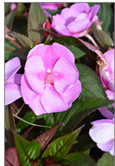
SunPatiens Vigorous Lavender Splash New Guinea Impatiens flowers

940 Montauk Highway Bayport, New York web: bayportflower.com phone: 1-800-729-0822