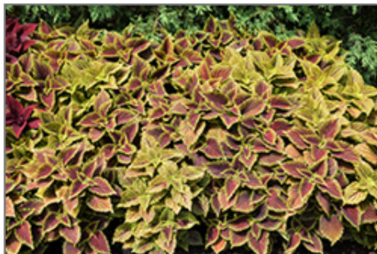
ColorBlaze Golden Dreams Coleus