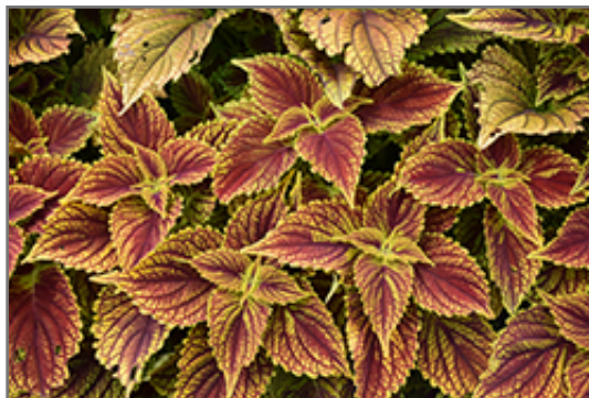
ColorBlaze Golden Dreams Coleus foliage