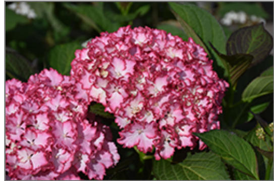
Seaside Serenade Fire Island Hydrangea flowers

This shrub will require occasional maintenance and upkeep, and should only be pruned after flowering to avoid removing any of the current season's flowers. It has no significant negative characteristics.