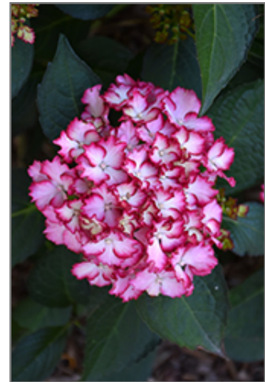
Seaside Serenade Fire Island Hydrangea flowers