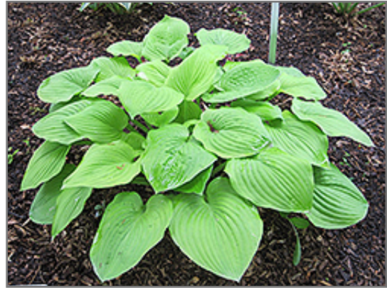
August Moon Hosta