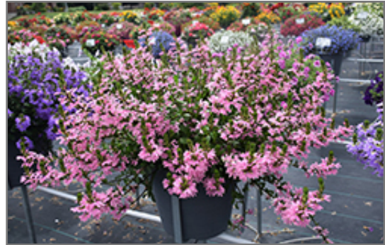
Whirlwind Pink Fan Flower in bloom

Whirlwind Pink Fan Flower is a fine choice for the garden, but it is also a good selection for planting in outdoor containers and hanging baskets. Because of its trailing habit of growth, it is ideally suited for use as a 'spiller' in the 'spiller-thriller-filler' container combination; plant it near the edges where it can spill gracefully over the pot. Note that when growing plants in outdoor containers and baskets, they may require more frequent waterings than they would in the yard or garden.