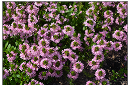
Whirlwind Pink Fan Flower flowers