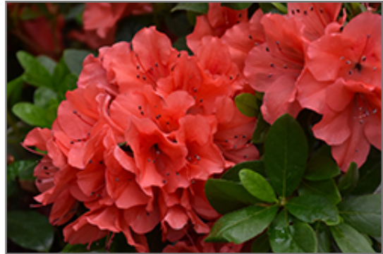
Encore Autumn Sunset Azalea flowers

When grown indoors, Encore Autumn Sunset Azalea can be expected to grow to be about 3 feet tall at maturity, with a spread of 3 feet. It grows at a slow rate, and under ideal conditions can be expected to live for approximately 40 years. This houseplant will do well in a location that gets either direct or indirect sunlight, although it will usually require a more brightly-lit environment than what artificial indoor lighting alone can provide. It requires an evenly moist well-drained soil for optimal growth, but will suffer if left to grow in standing water. The surface of the soil shouldn't be allowed to dry out completely, and so you should expect to water this plant once and possibly even twice each week. Be aware that your particular watering schedule may vary depending on its location in the room, the pot size, plant size and other conditions; if in doubt, ask one of our experts in the store for advice. It is very fussy about its soil conditions and must be grown in rich, acidic soil to ensure success. Contact the store for specific recommendations on pre-mixed potting soil for this plant.