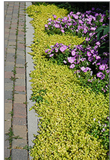
Golden Creeping Jenny