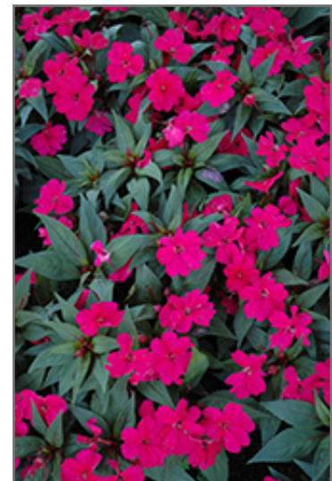
SunPatiens Compact Royal Magenta New Guinea Impatiens flowers