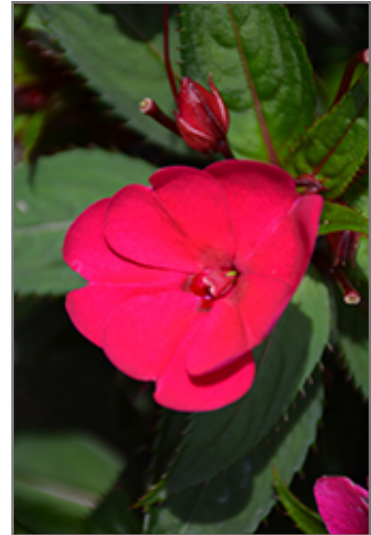
SunPatiens Compact Royal Magenta New Guinea Impatiens flowers

This plant will require occasional maintenance and upkeep, and should not require much pruning, except when necessary, such as to remove dieback. It is a good choice for attracting bees and butterflies to your yard. It has no significant negative characteristics.