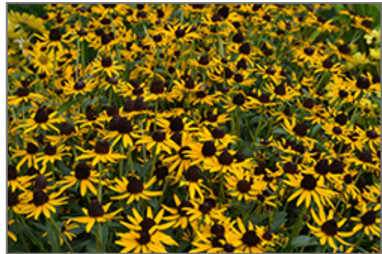
Little Goldstar Coneflower flowers