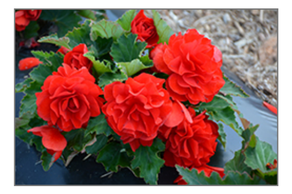
Nonstop Red Begonia in bloom

940 Montauk Highway Bayport, New York web: bayportflower.com phone: 1-800-729-0822