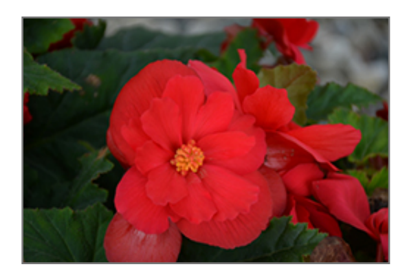
Nonstop Red Begonia flowers