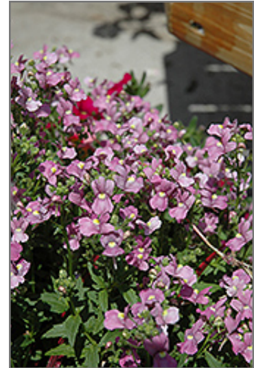
Compact Pink Innocence Nemesia flowers