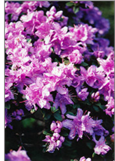
Ramapo Rhododendron flowers

Ramapo Rhododendron will grow to be about 3 feet tall at maturity, with a spread of 3 feet. It has a low canopy. It grows at a slow rate, and under ideal conditions can be expected to live for 40 years or more.