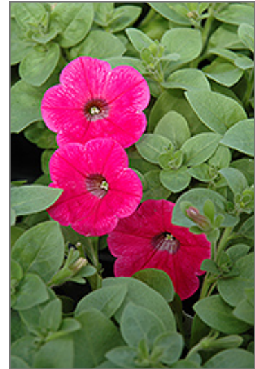
Piccola Hot Pink Petunia flowers