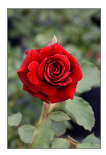
Don Juan Rose flowers