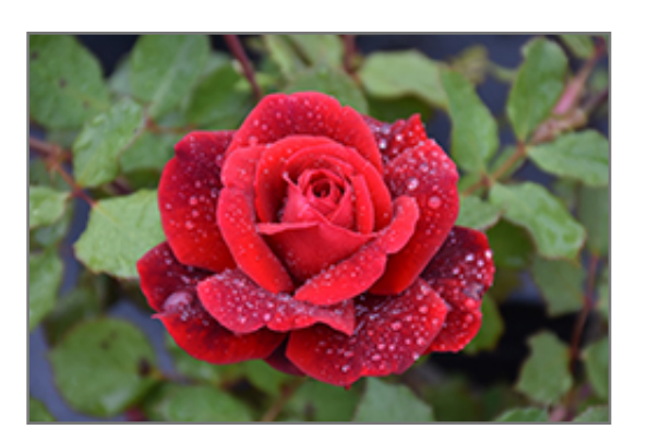
Don Juan Rose flowers

This woody vine will require occasional maintenance and upkeep, and should only be pruned after flowering to avoid removing any of the current season's flowers. It is a good choice for attracting bees and butterflies to your yard. Gardeners should be aware of the following characteristic(s) that may warrant special consideration;