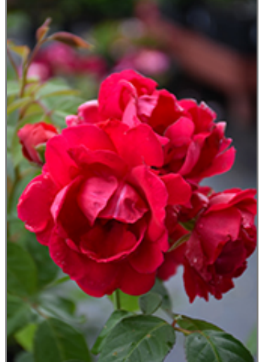
Blaze Rose flowers

940 Montauk Highway Bayport, New York web: bayportflower.com phone: 1-800-729-0822