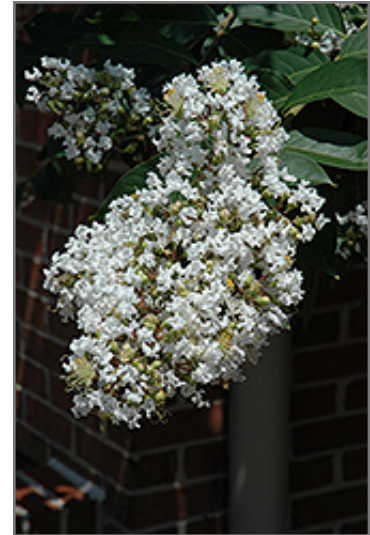
Natchez Crapemyrtle flowers

Natchez Crapemyrtle is recommended for the following landscape applications;