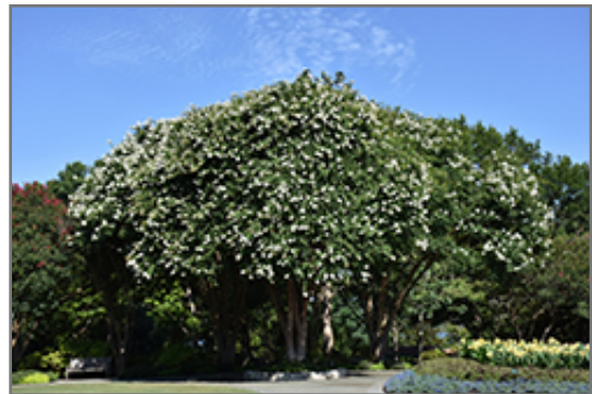
Natchez Crapemyrtle in bloom