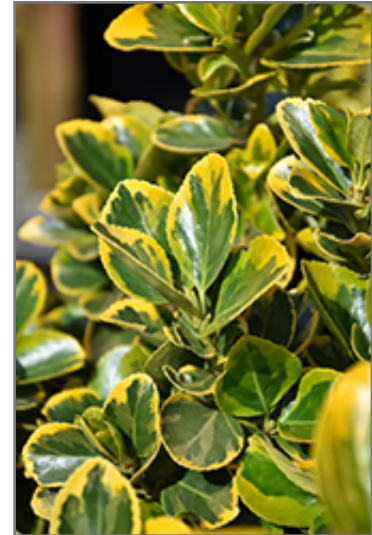
Gold Variegated Japanese Euonymus foliage