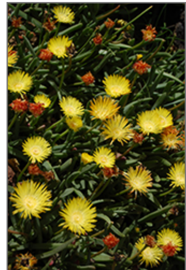
Yellow Ice Plant flowers