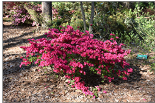
Girard's Fuchsia Evergreen Azalea in bloom