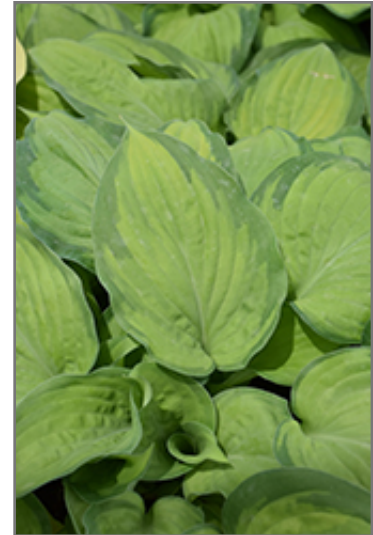
Paradigm Hosta foliage

Paradigm Hosta will grow to be about 10 inches tall at maturity extending to 18 inches tall with the flowers, with a spread of 4 feet. When grown in masses or used as a bedding plant, individual plants should be spaced approximately 4 feet apart. Its foliage tends to remain low and dense right to the ground. It grows at a medium rate, and under ideal conditions can be expected to live for approximately 10 years. As an herbaceous perennial, this plant will usually die back to the crown each winter, and will regrow from the base each spring. Be careful not to disturb the crown in late winter when it may not be readily seen!