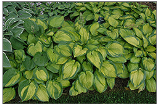
Paradigm Hosta