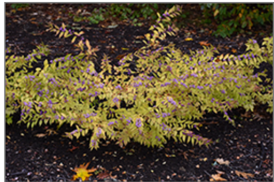
Early Amethyst Beautyberry fruit